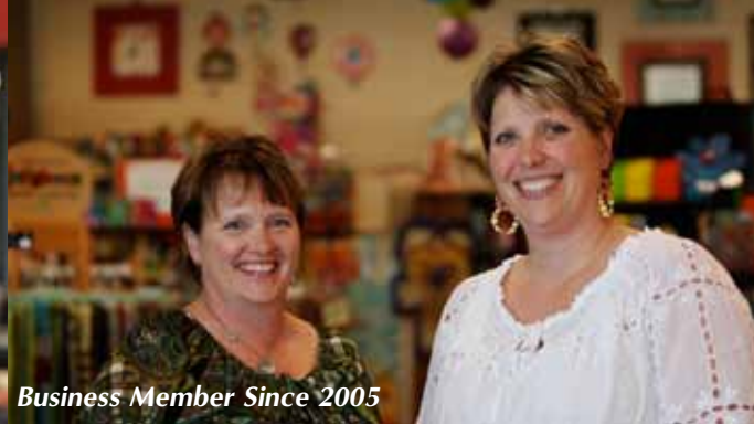
Business Member Since 2005