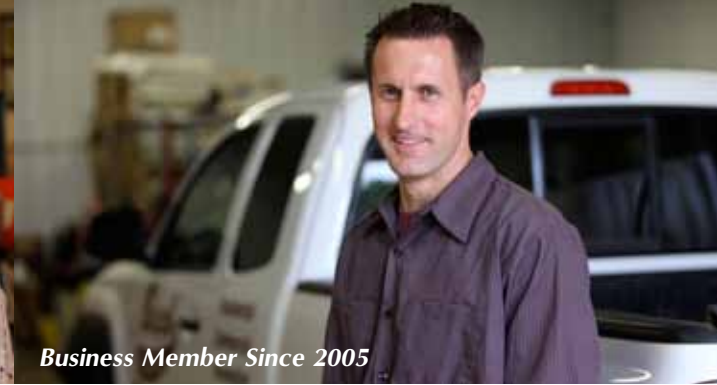
Business Member Since 2005