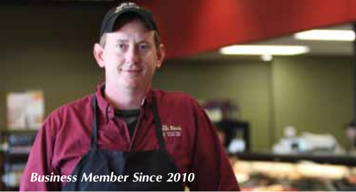
Business Member Since 2010