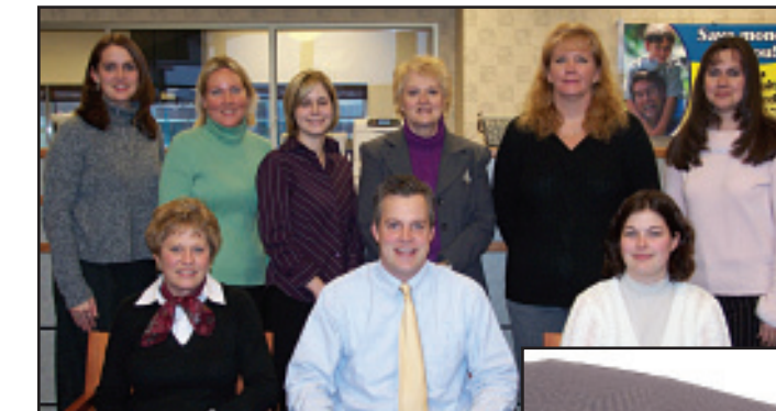
Staff at our new Neenah office: