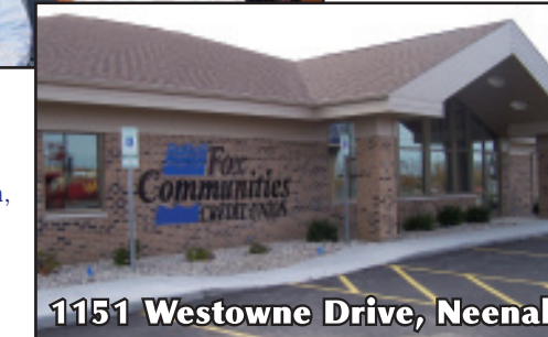
1151 Westowne Drive, Neenah